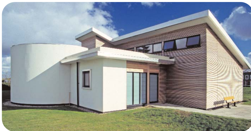
"Classroom of the Future" Hobart High School, Norwich