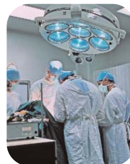
Peterborough District Hospital, Cambridgeshire