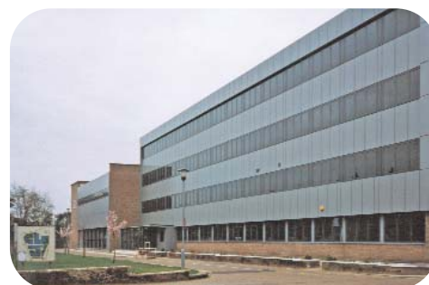
The College of West Anglia

New build class room block and remodelling of class rooms within existing school