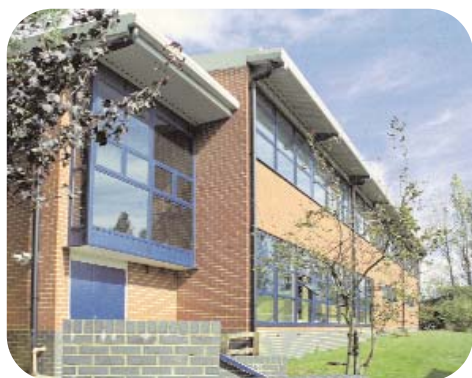
Bishop Stopford School, Kettering

New endoscopy, minor operations and patient accommodation block for Peterborough Hospital NHS Trust. Full comfort cooling and emergency back up power provision.